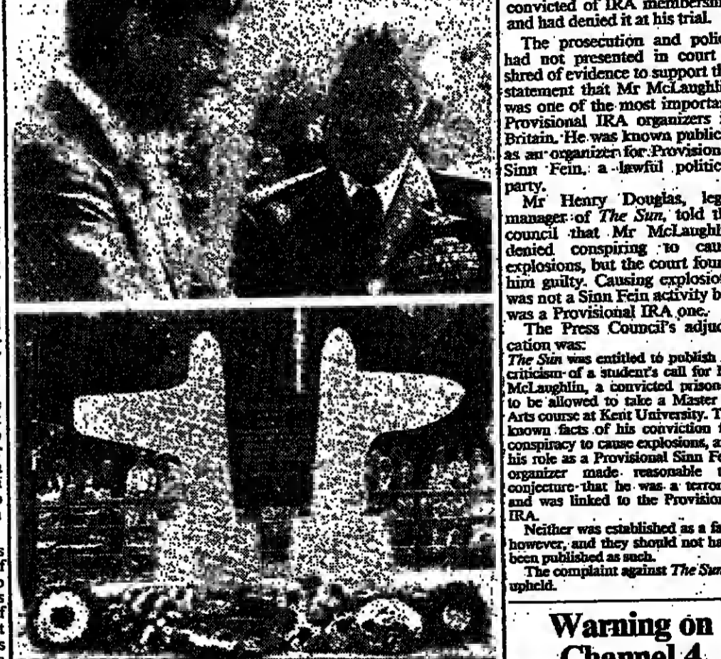
Duke's memorial visit The Duke of Gloucester unveiled a memorial to Second World War airmen at King's Cliffe airfield, near Peterborough, yesterday.

Six polytechnics will be rewarded with more money and extra students at the start of the 1984 academic year but three; the City of London Polytechnic, the Central London Polytechnic and Oxford, will lose out badly.